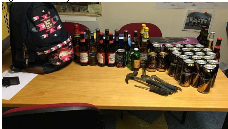
This tweet received over 1,800 impressions

Community Safety Wardens confiscated 75 items of alcohol from underage drinkers last night in Newbridge & Crosskeys